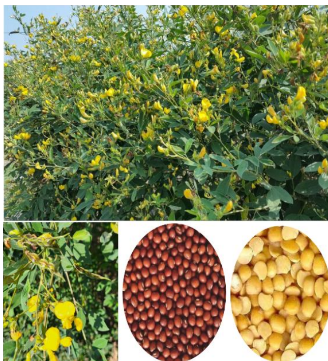
Fig. 2 : Field view, Flower, Pod, Seed and Dal of TDRG 272.

segregating generations. Uniform bulks were made in F_5 generation after attaining homogeneity within the progenies/families. The promising bulked progenies were tested in station trials (Observation Yield trial OYT, Preliminary yield trial, PYT and Advanced yield trial, AYT) at ARS, Tandur for three years from kharif 2019 to kharif 2021 and the promising culture TDRG 272 was identified. The culture was tested in All india coordinated trials (Initial varietal trial, IVT, Advanced varietal trial, AVT I and Advanced varietal trial, AVT II) from 2021-2023 and its performance with respect to yield, flowering duration, pest, disease resistance (through natural infestation at hot spot locations) were assessed. Proximate analysis was performed at Quality Control Laboratory, PJTAU, Rajendranagar, Hyderabad using standard procedures. Thus, the development of the culture was accomplished at ARS, Tandur and assessment of its performance was done through multilocation testing under AICRP system (Fig. 1, Tables 1, 2).